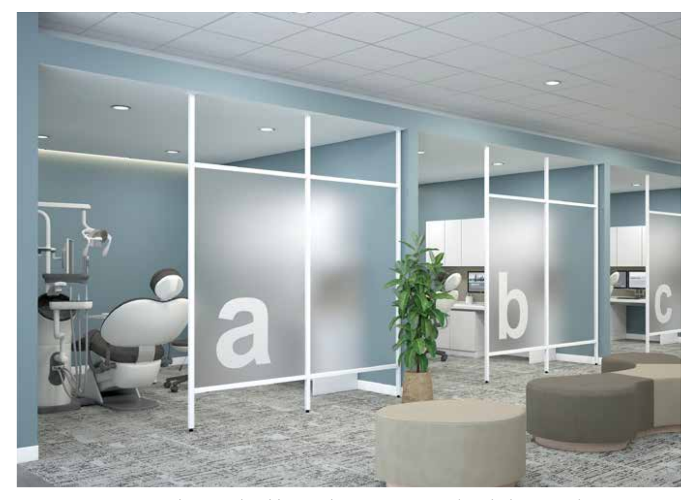
Intersection Panels with Translucent Custom Painted Glass Panels and White Powder Coat Frames.