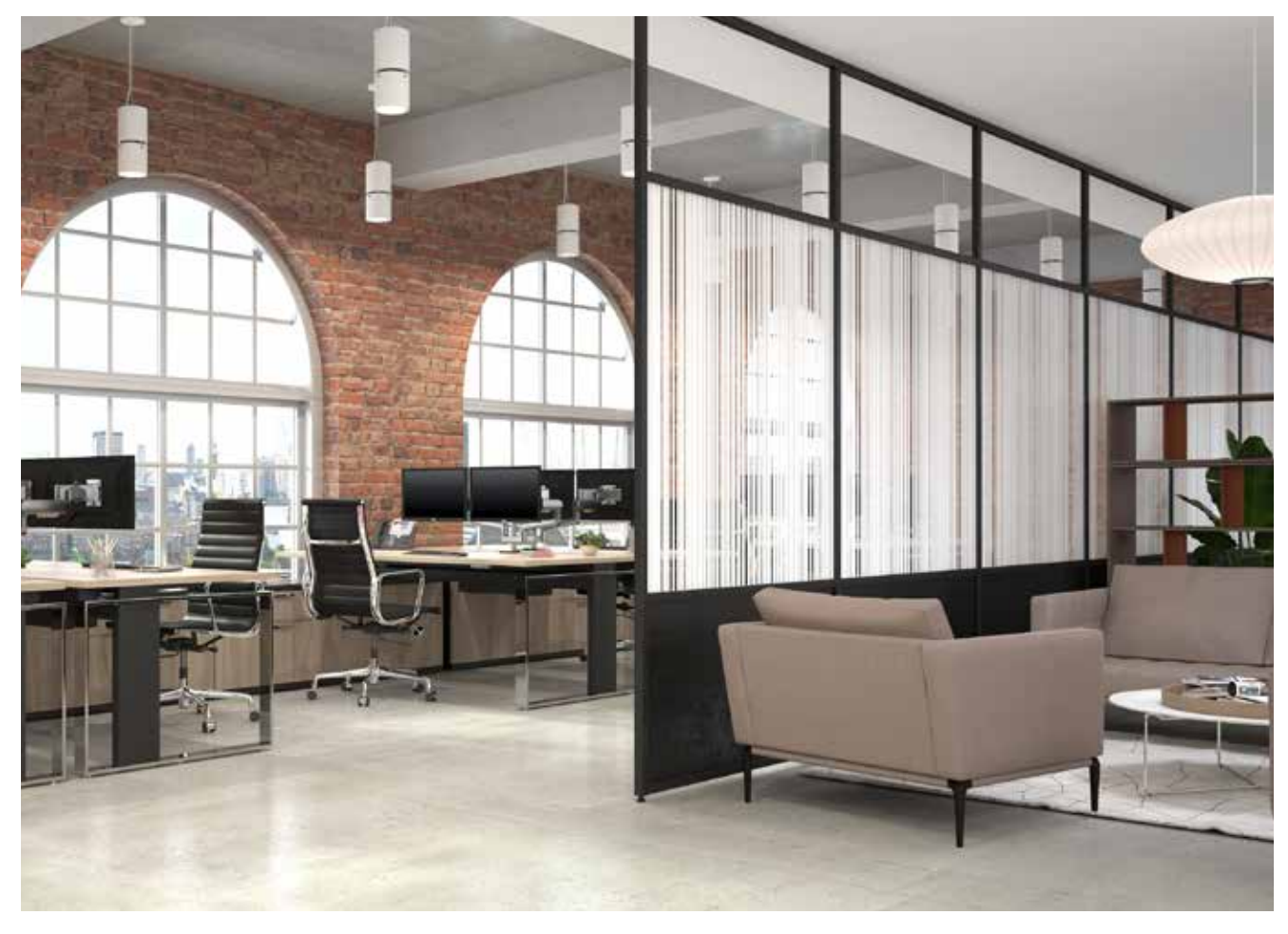
Intersection Panels with Custom Decorative Glass Inserts and Custom Color Powder Coat Frames.