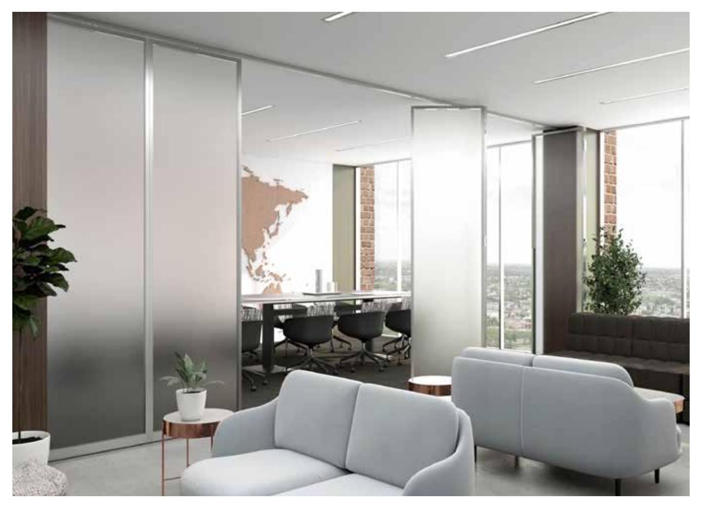
Intersection Stack with Translucent Glass Panels. Also available in Back Painted Glass Panels, Porcelain, Fabric or Acousticor Panels.