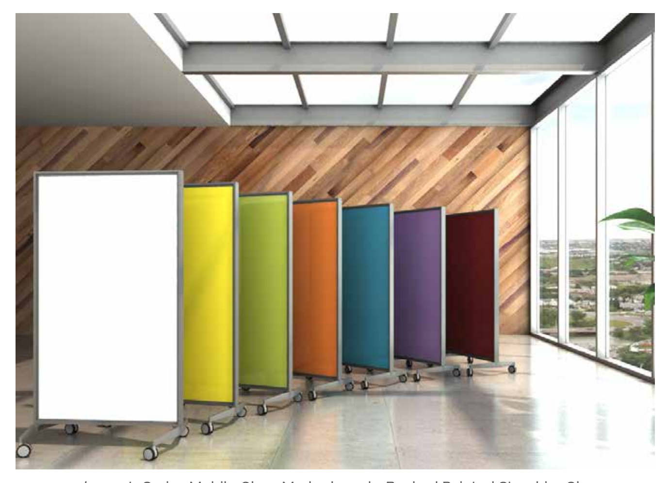
elements Series Mobile Glass Markerboards: Backed Painted Starphire Glass matched to almost any color and of your choice in Black Frames or Anodized Aluminum.