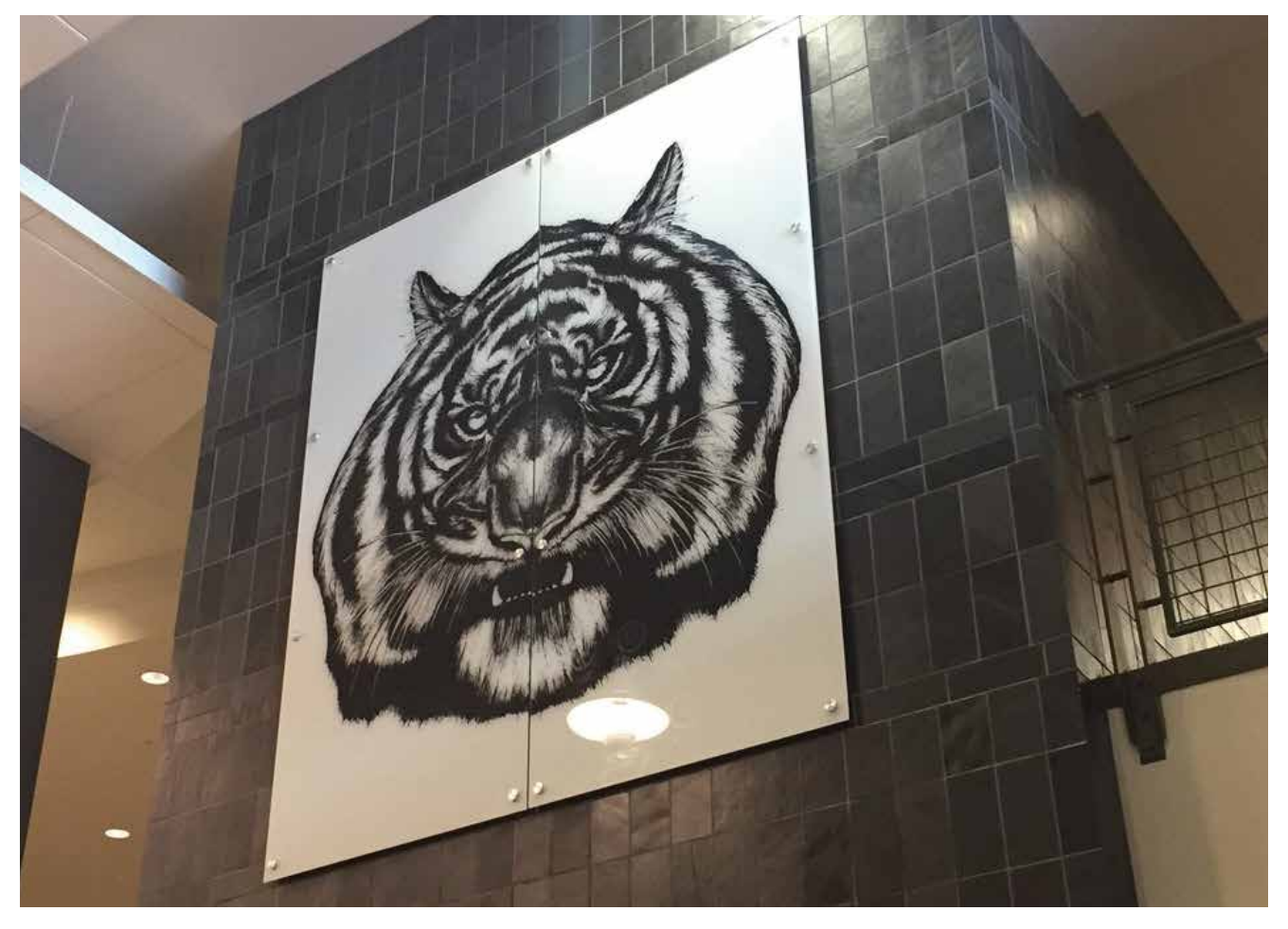
Custom graphics make the Glassboard a design element for any environment.