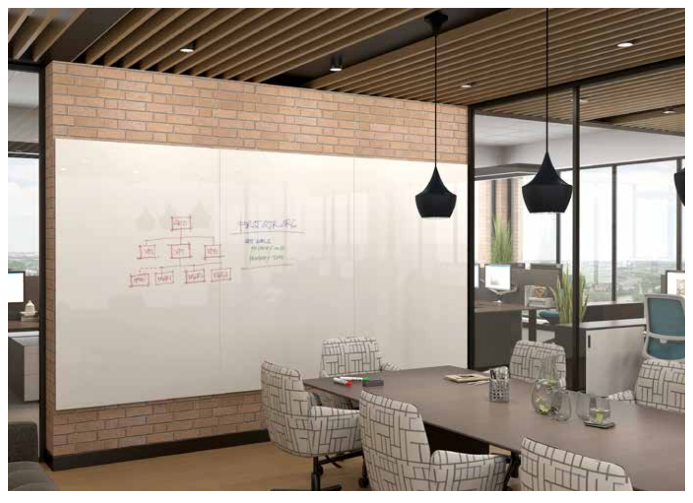
Frameless Glassboards in Classic Starphire