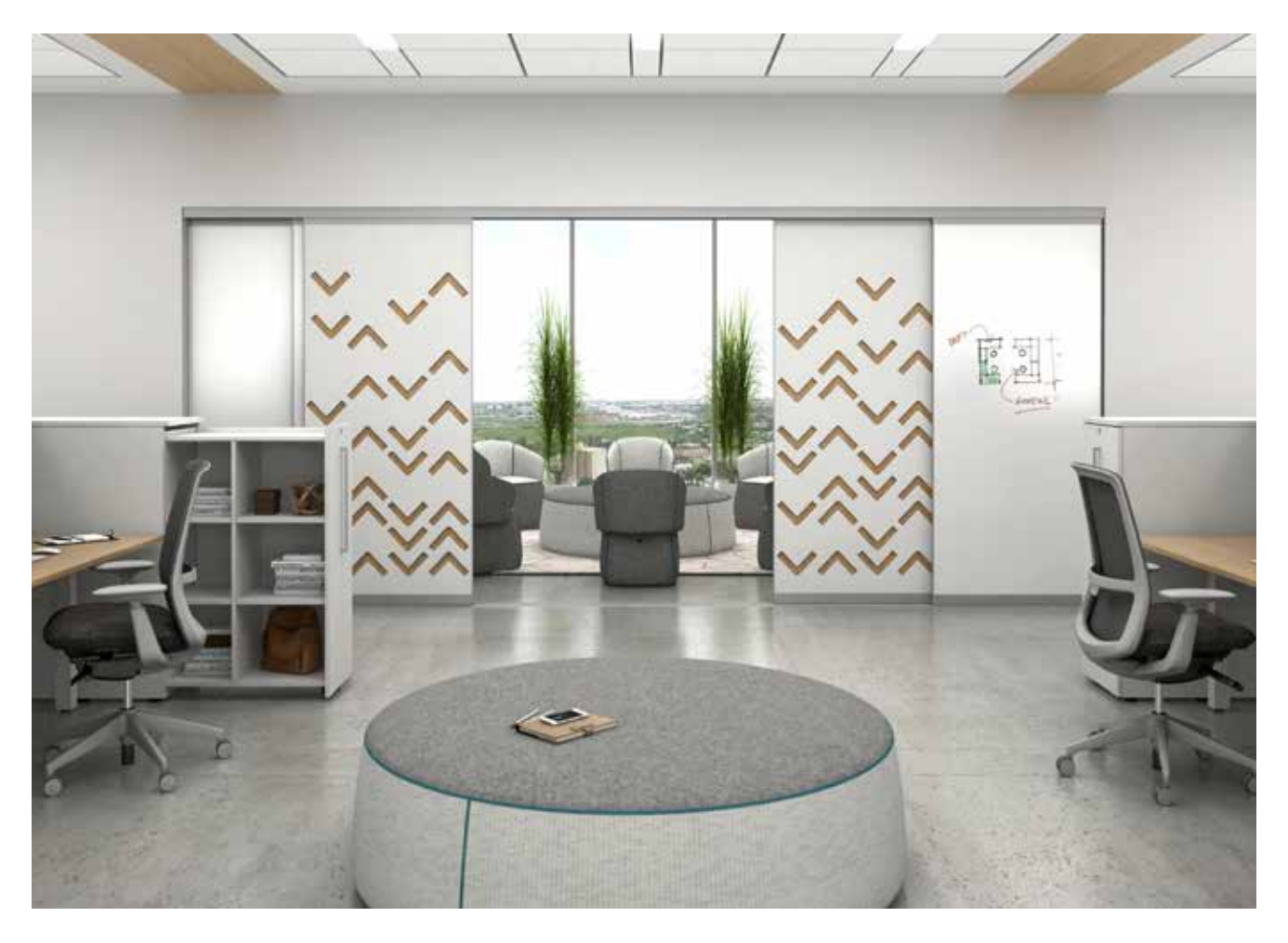
VIP+ Sliding Wall Panels with Translucent Glass Panels with Custom Cut-Out Acousticor Panels.