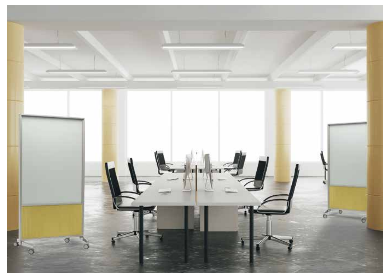
elements Series Mobile CombiBoards with Back Painted Glass Panels, Acousticor Inerts and Anodized Aliminum Frames.