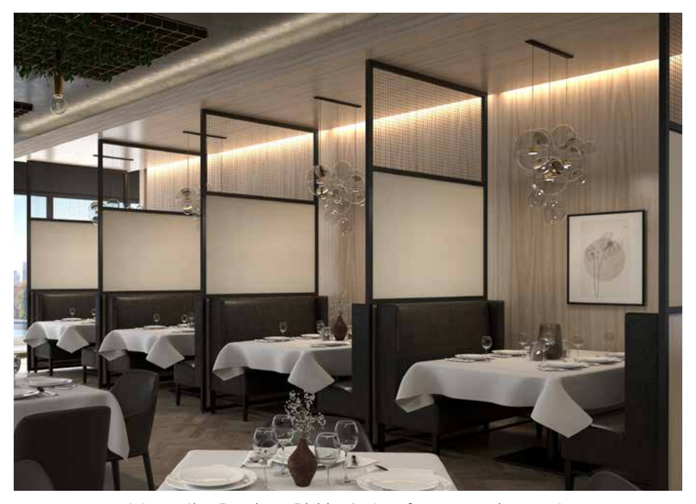
Intersection Panels—a Divider System for open environments, shown here with Custom Metal Mesh and Classic Starphire Back Painted Glass Panels.