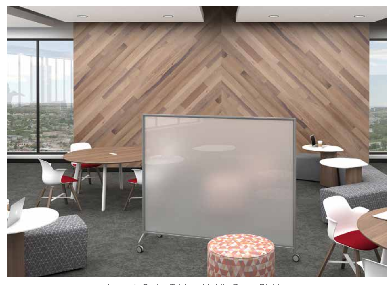
elements Series Tri-Leg Mobile Room Dividers-flexible sizes, almost unlimited colors and glass styles are available.