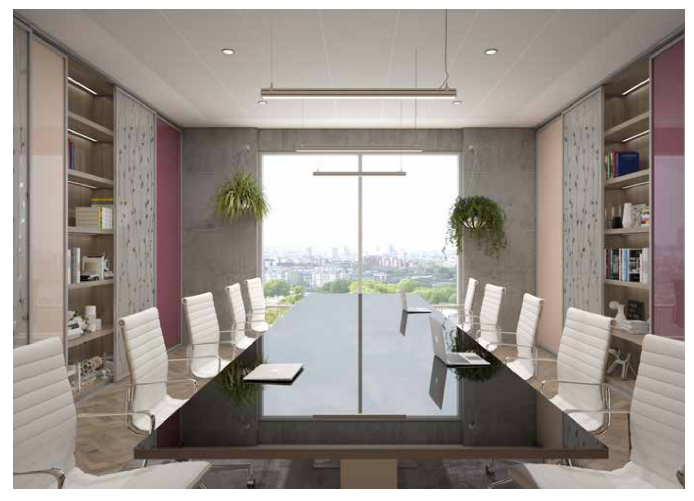
Intersection Slide with Custom Color Back Painted Glass Panels and Decorative Glass Panels.