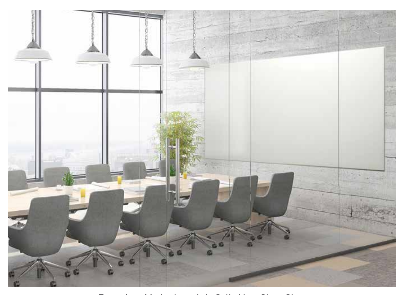
Frameless Markerboards in Satin Non-Glare Glass.