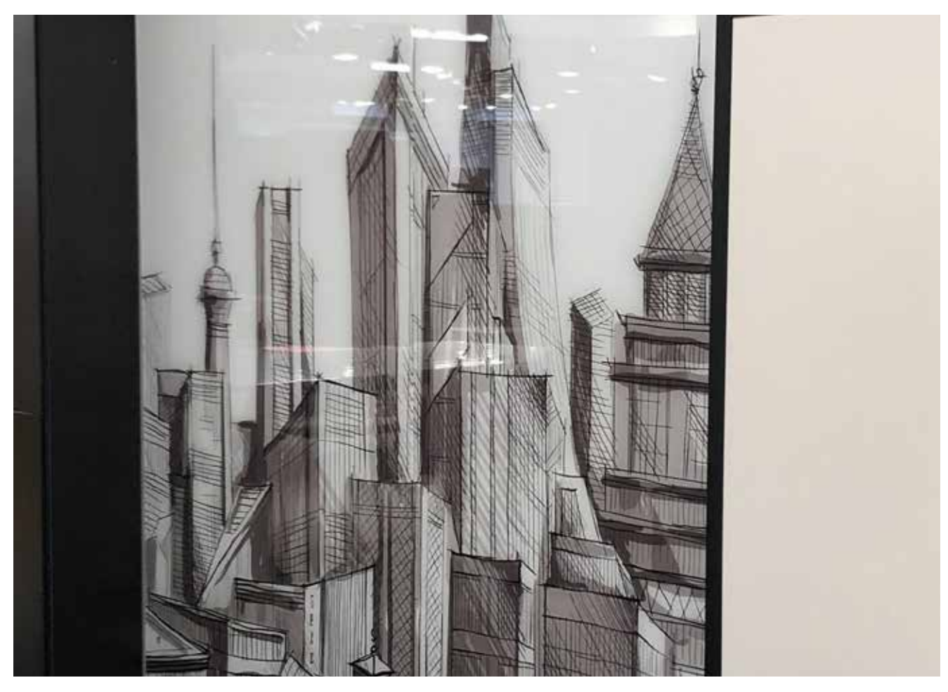
Frameless Back Painted Corona White Glass with Printed Custom Graphics.