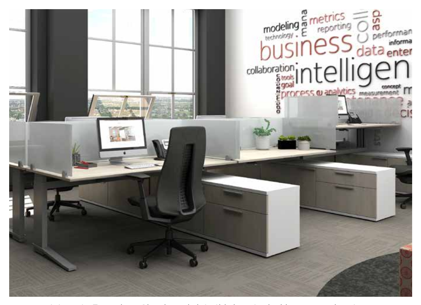
Integrate Frameless Glassboards into third-party desking or panel systems to define space and privacy and enhance social distancing. Plus add functionality and style to your office.