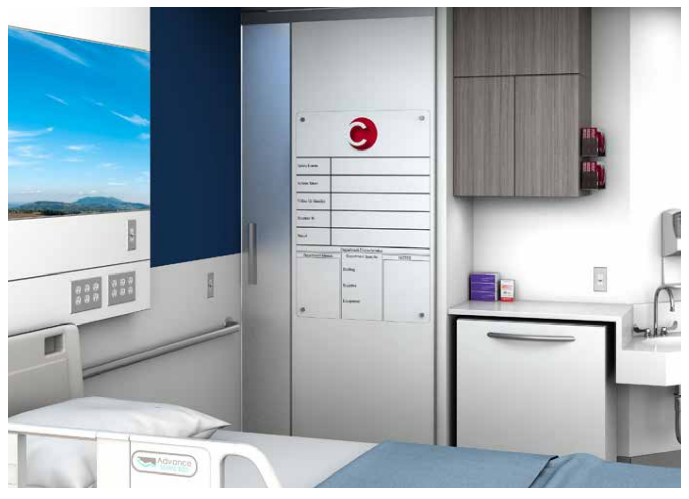
Custom VIP+ Sliding Patient Room Boards for healthcare applications that require high anti-microbial functionality.