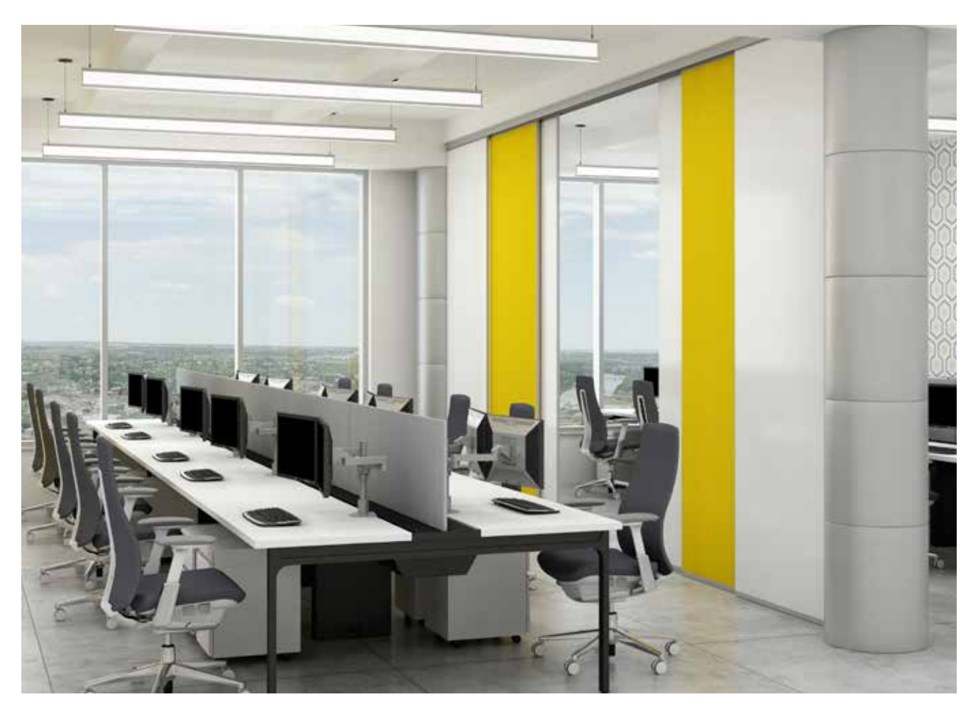
VIP+ Sliding Wall Panels with Back Painted Custom Color Glass Panels.