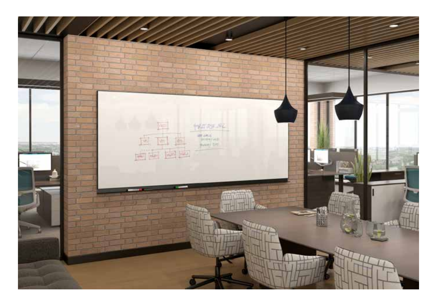
elements Series Framed Glassboards in Classic Starphire and Black Powder Coat Frames with Integrated Penshelf.