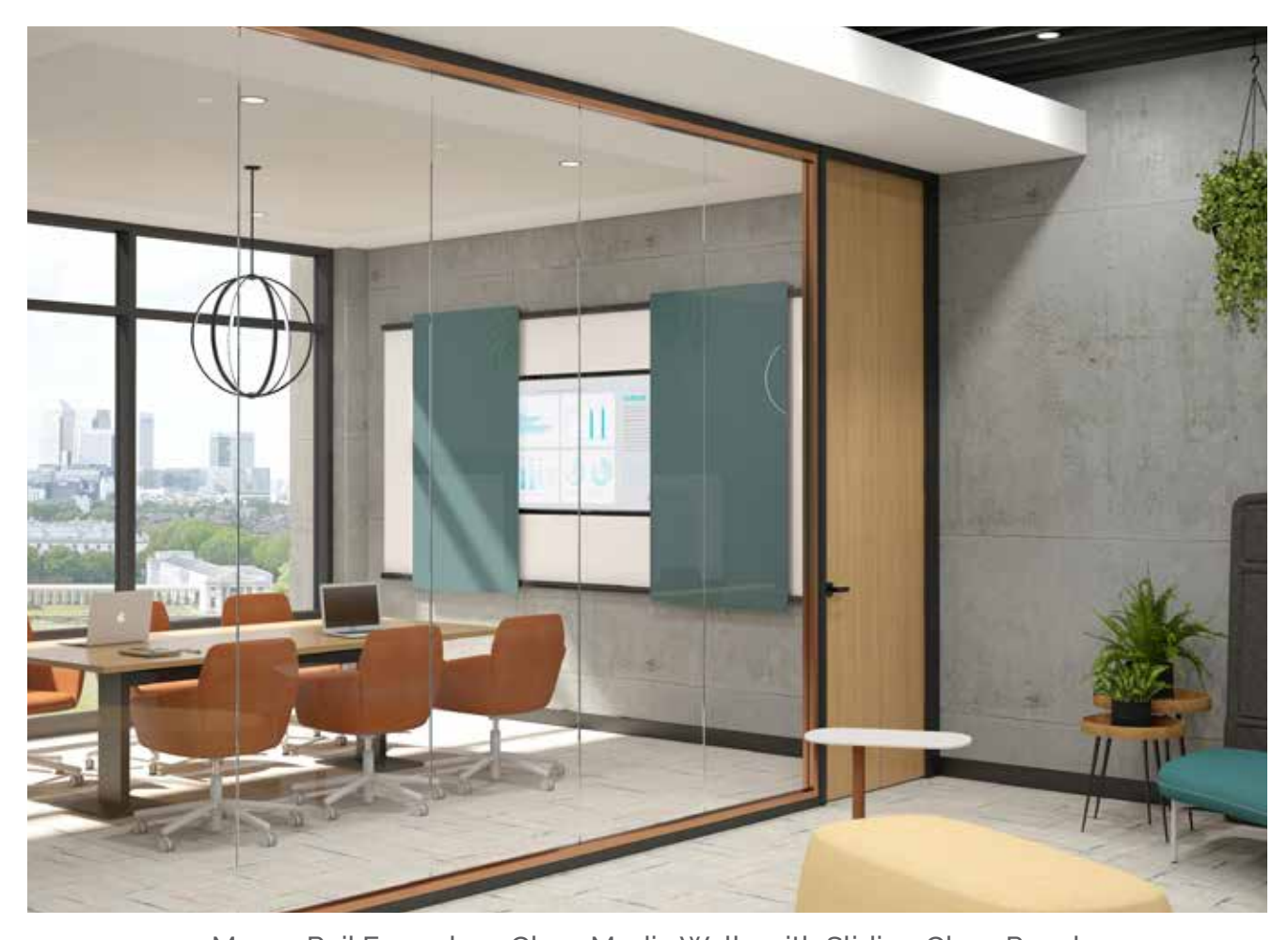
Merge Rail Frameless Glass Media Walls with Sliding Glass Panels and custom cutouts to accommodate recessed technology.