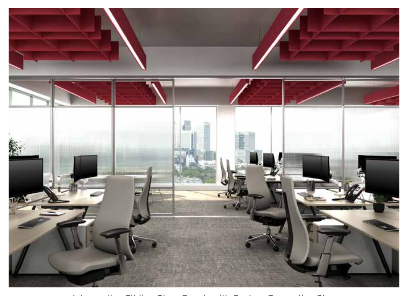
Intersection Sliding Glass Panels with Custom Decorative Glass and Acousticor Acoustic Ceiling Baffles