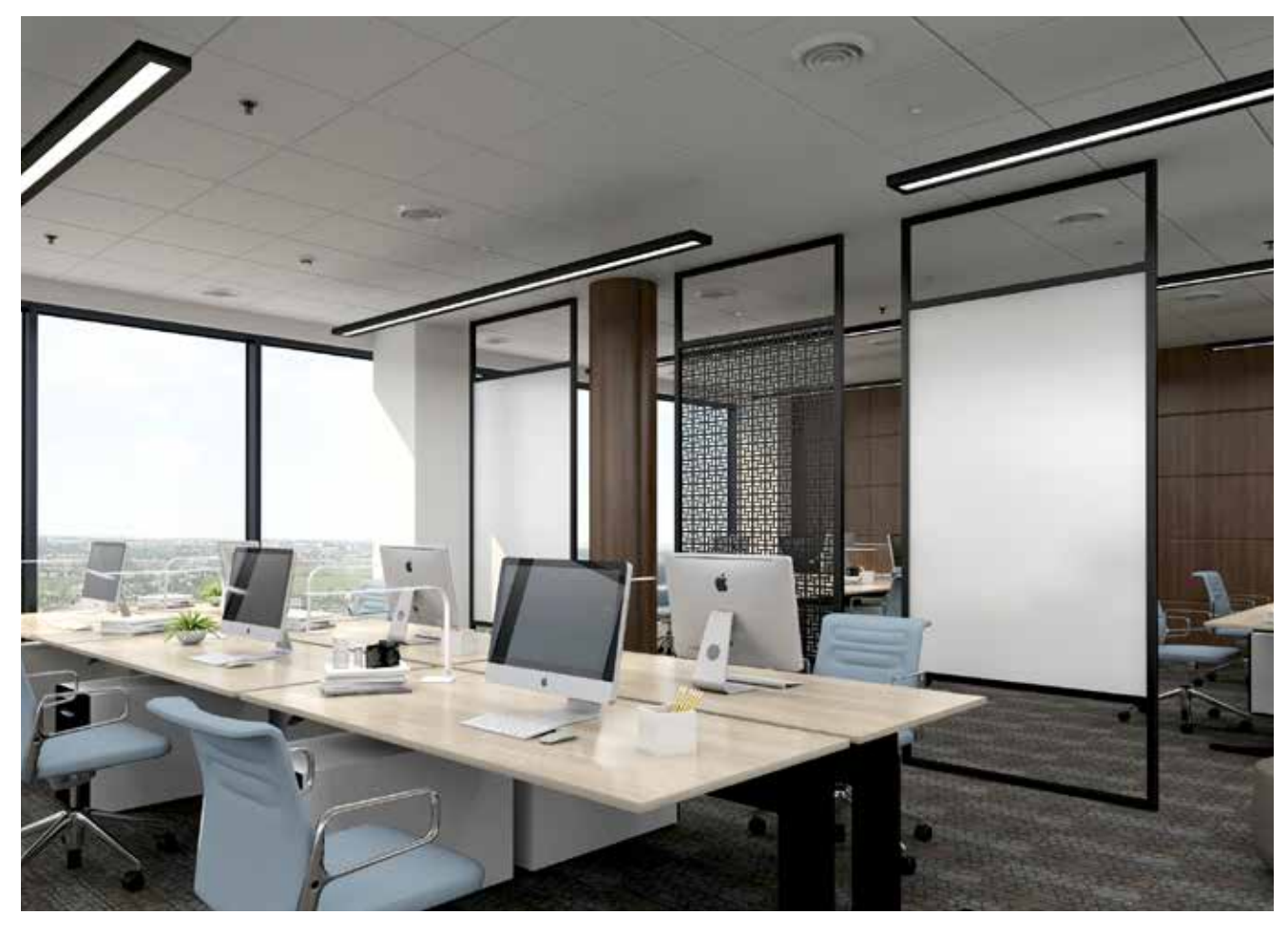
Intersection Panels with Back Painted Satin Non-Glare Glass Panels, Custom Cut-Out Wire Mesh and Black Powder Coat Frames.